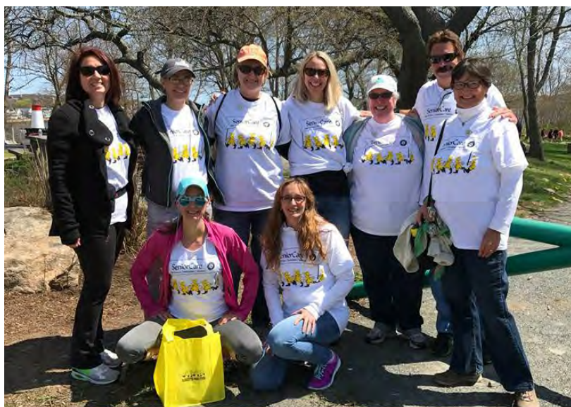
Team SeniorCare @ Gloucester Pride Stride 2017

"Aging has a wonderful beauty and we should have respect for that."