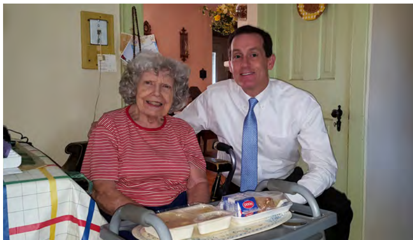
Beverly Mayor Mike Cahill delivered meals in Beverly during the annual March for Meals Awareness Campaign.